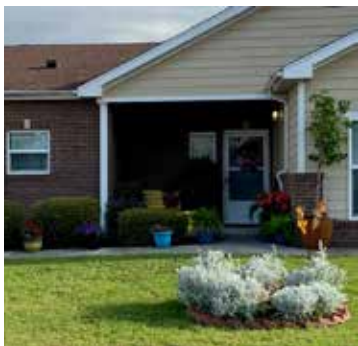
East Falcon - 110 Foulois