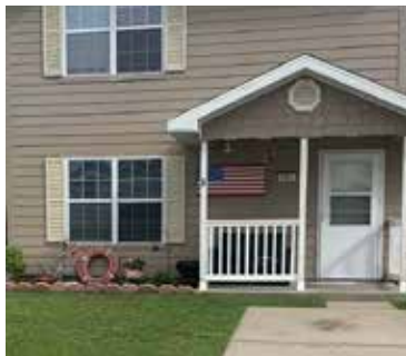
Sandhill Landing - 7661 Wiregrass