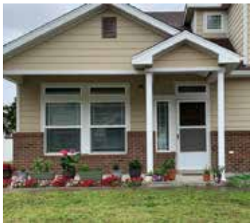
Bay Ridge - 642 Power