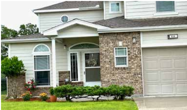
West Falcon - 216 Fairchild