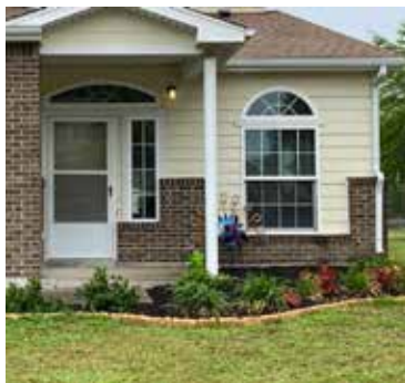
Thrower Park - 139 Sweeney